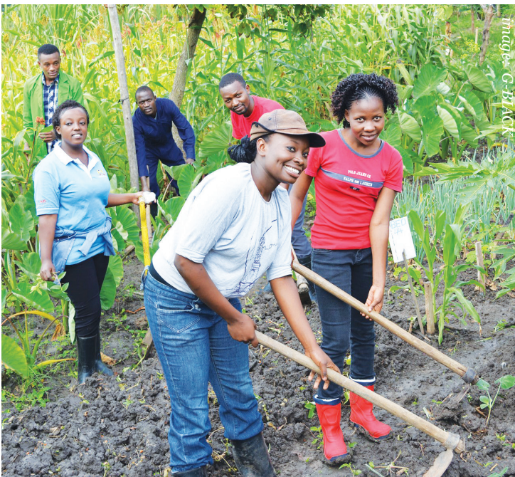
Participants in G-BIACK's 2020 Youth in Agroecology Program learning GB

We are also asking that you, our global GROW BIO-INTENSIVE Family, tell us about any organizations, foundations, or individuals who might be enlisted to support this very special project. G-BIACK is working hard to make our world better. Let's get them the help they need, to help those who need it most! •