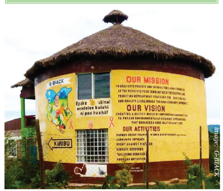
The GROW BIOINTENSIVE Agriculture Centre of Kenya