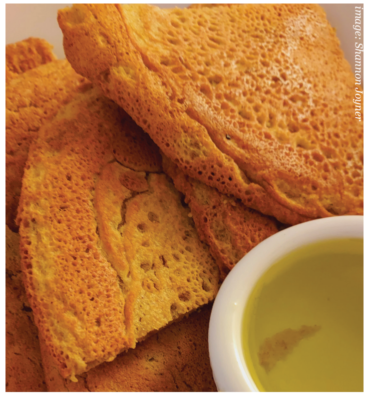
ECOLOGY ACTION'S GARDEN COMPANION

Sprinkle with flaky sea salt and serve hot with a good quality olive oil for dipping, or with anything you'd enjoy with naan. Leftovers will keep for 3 days or in the freezer for up to 1 month. Enjoy at room temperature or reheat on stovetop until warm.