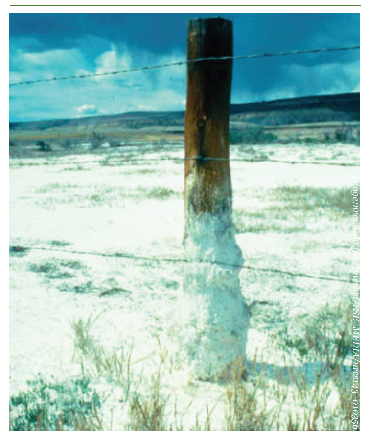
Salt-affected soils on Colorado range land. As the water evaporates, salts dissolved from the soil deposit and accumulate at the soil surface. Notice the crust of salt deposited on the ground and on the base of the fence post.