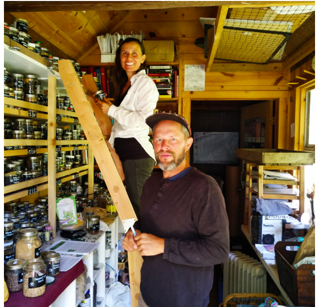
Browsing the VGFP Seed Bank

In the community of Point Arena, CA (35 miles from VGFP) over 70% of children grow up in poverty. A local non-profit and the Point Arena City Council have approached VGFP to help them pass a Garden Friendly Community Resolution and organize a community-based food movement incorporating local composting programs and community gardens, like the work we did with Fort Bragg, CA . It is anticipated that in 2023, several individuals will be identified and supported to participate in VGFP's GardenCorps Program to strengthen these efforts. We hope that communities who pass the GFC Resolution and GardenCorps graduates will communicate with each other and demonstrate how these efforts can create a network of small teams trained in GB to be resources, influencers, and teachers in our overlapping communities. Our 2021 GardenCorps graduates have gone on to form a Board of Directors in Fort Bragg establishing a community garden, and providing resources and classes to their community.