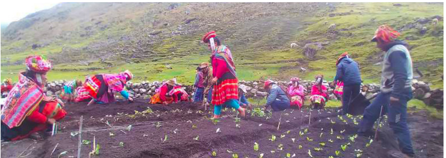
One of dozens of GB school gardens established in the Peruvian highlands by NGO Por Eso Peru (part of the Latin American GB network) in 2022

A challenge throughout ECOPOL's existence has been accomplishing a huge amount of work with only a few people. In 2022, two new positions were added to the team: one person focused on networking, social media, and graphic design