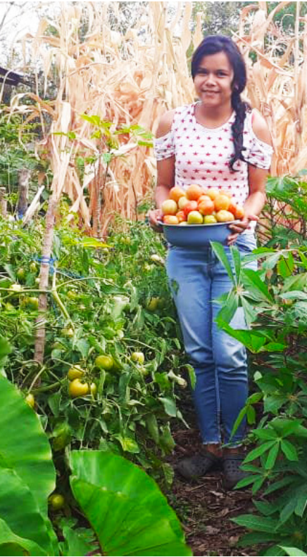
A newly certified Basic-Level GB Teacher in Nicaragua in her Mini-Farm