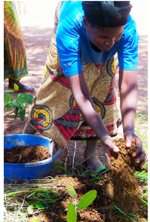
Building a compost pile at Mbowe

GBACM Demonstration Mini-Farm "Mbowe" is in Mzuzu, the main city in Malawi's Northern Region, which provides a service hub for the remote north. Since 2014, GMB has implemented their Empowering Rural Poor in Malawi Project in Mzimba, the largest district in Malawi, with the goals of increasing long-term household nutrition, food security, and income; strengthening local development structures and programs to improve livelihoods among resource poor families; and improving collective sustainable agriculture skills.