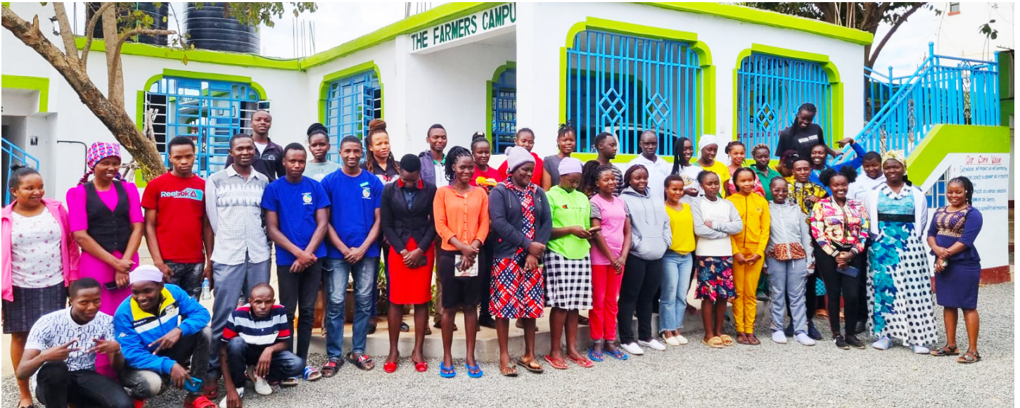
G-BIACK Students and Interns in 2022

at G-BIACK are also trained in construction of solar cookers and solar dehydrators, and how to use them in the G-BIACK Solar Cookers and Dehydrators Project . They use this resource-free technology at G-BIACK to cook for the large number of people fed each day, and the farmers who learn to build and use these appliances are able to cook and preserve food without the use of expensive and polluting fuels.