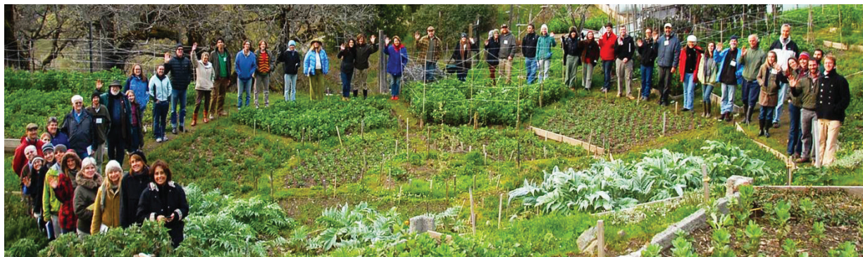
GROW BIOINTENSIVE workshop participants at our Willits Headquarters

ECOLOGY ACTION • 5798 RIDGEWOOD ROAD • WILLITS, CA • 95490