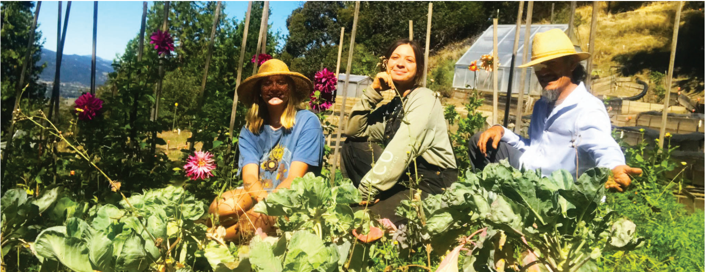
The Jeavons Center Farmer Teacher-Trainer Team, 2022

provided by potatoes grown on only 2.4% of the cropland! 65-day maturing varieties provide the same yield as 120-day varieties which means fewer bed/crop months to harvest. At TJC, we begin sprouting potato starts on January 15, planting on February 15 on 9-inch offset centers, 6-inches deep, with sprouts emerging from soil on March 15, and harvesting beginning on May 15. Oaxaca Green Corn is a 3-month maturing variety that yields more calorie-containing seed in our cool nighttime climate than other varieties; it also tastes good and produces a good amount of dry biomass for composting. Corn is best planted at our site around June 15 and harvested around October 1. We are also experimenting with other timing.