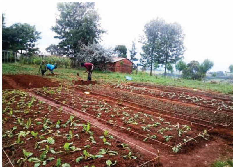
Njoki's 40-Bed GROW BIOINTENSIVE Garden in Kenya