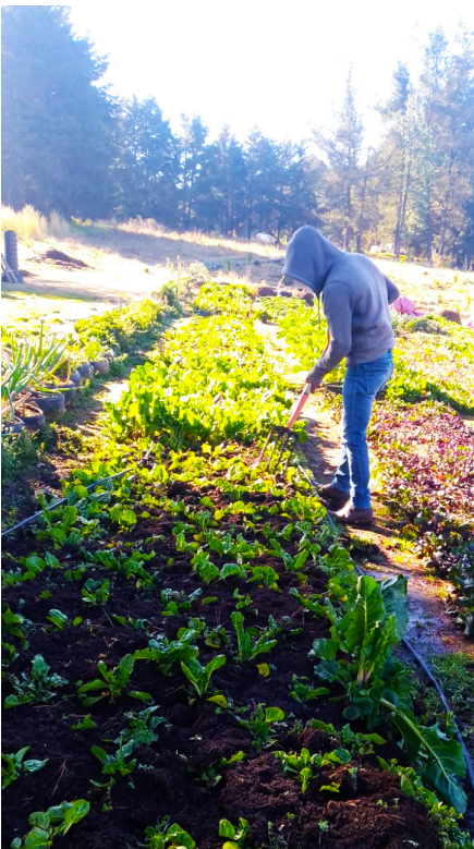
GB Garden Projects established by ECOPOL/EM Network Member Un Kilo de Ayuda in Mexico

Ecology Action's 8-Month Internship is popular with ECOPOL/EM's network of GB practitioners, but since the classes are conducted in English, participants with varying levels of English language skills benefit from a Spanish language