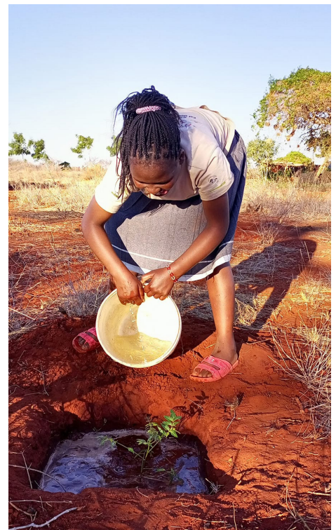
Planting a Tree Sapling in a Water-Conserving Fertility Trench at Garden of Hope

Other work includes maintaining a growing list of partnerships and networks (including building GB demonstration gardens and teaching soil-growing and